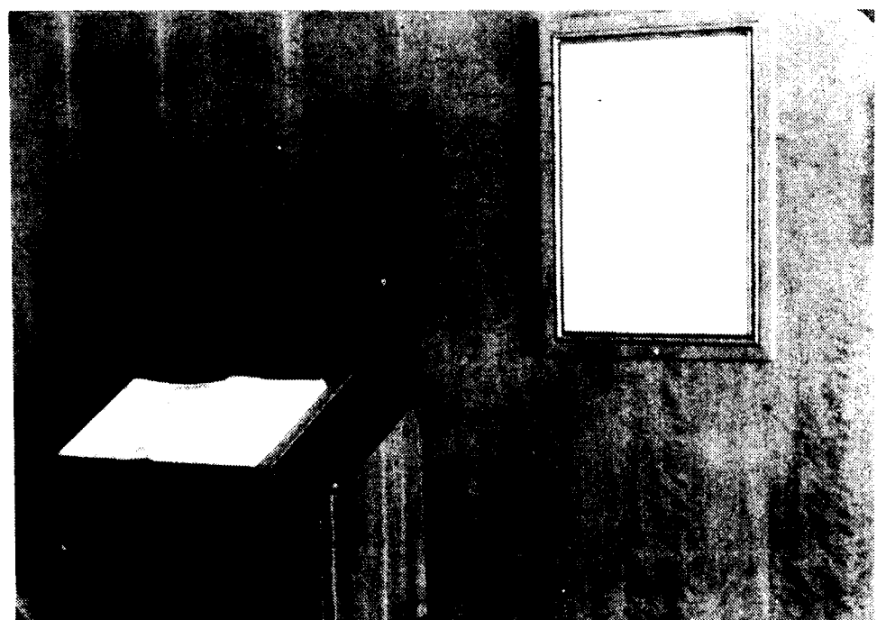
Students coming to Capitol Campus and returning will discover increased parking fines this year. Another change is the placement of the substitute vehicle book in the lobby instead of the Round Table.