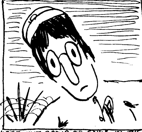
"SEE THAT GROUP OF GUYS IN THE CORNER REALLY PACKED IN TIGHT?"