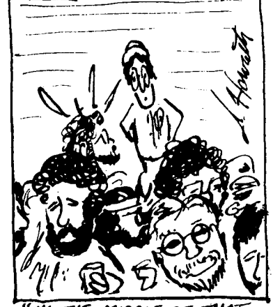
"IN THE MIDDLE OF THAT.. IS A GIRL."