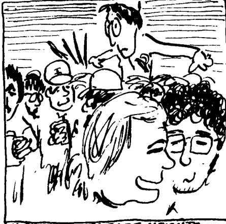
"THIS IS A MEADE HEIGHTS PARTY.. STAND ON THIS CHAIR."