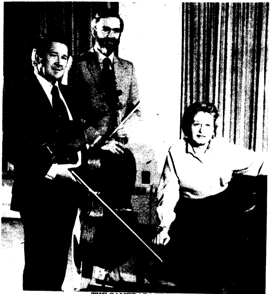
THE CAMERATA TRIO

The public is invited to attend the performance and workshop. Admission is free.