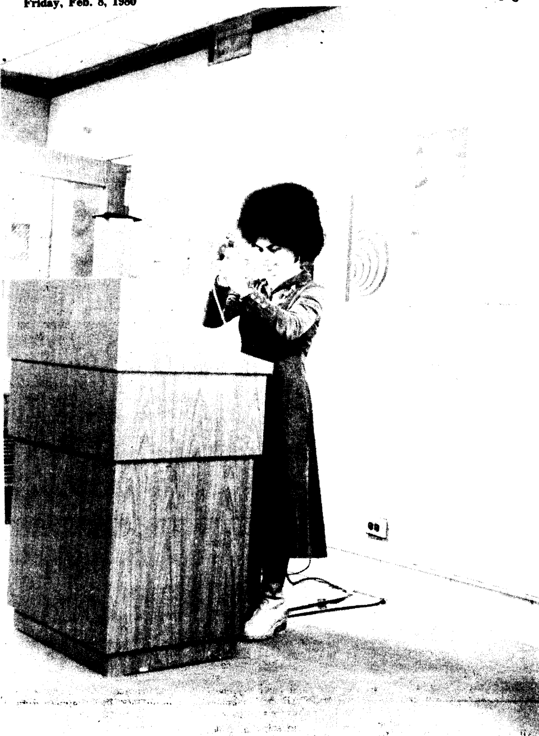
Sonia Sanchez prepares for the lecture she presented in the Gallery Lounge January 31 as part of the Provost Lecture Series.

BSU is sponsoring a Valentine's Day Dance Feb. 12 9 p.m. to 1 a.m. in the Student Center Cost is $1.50 per person, $2.00 per couple