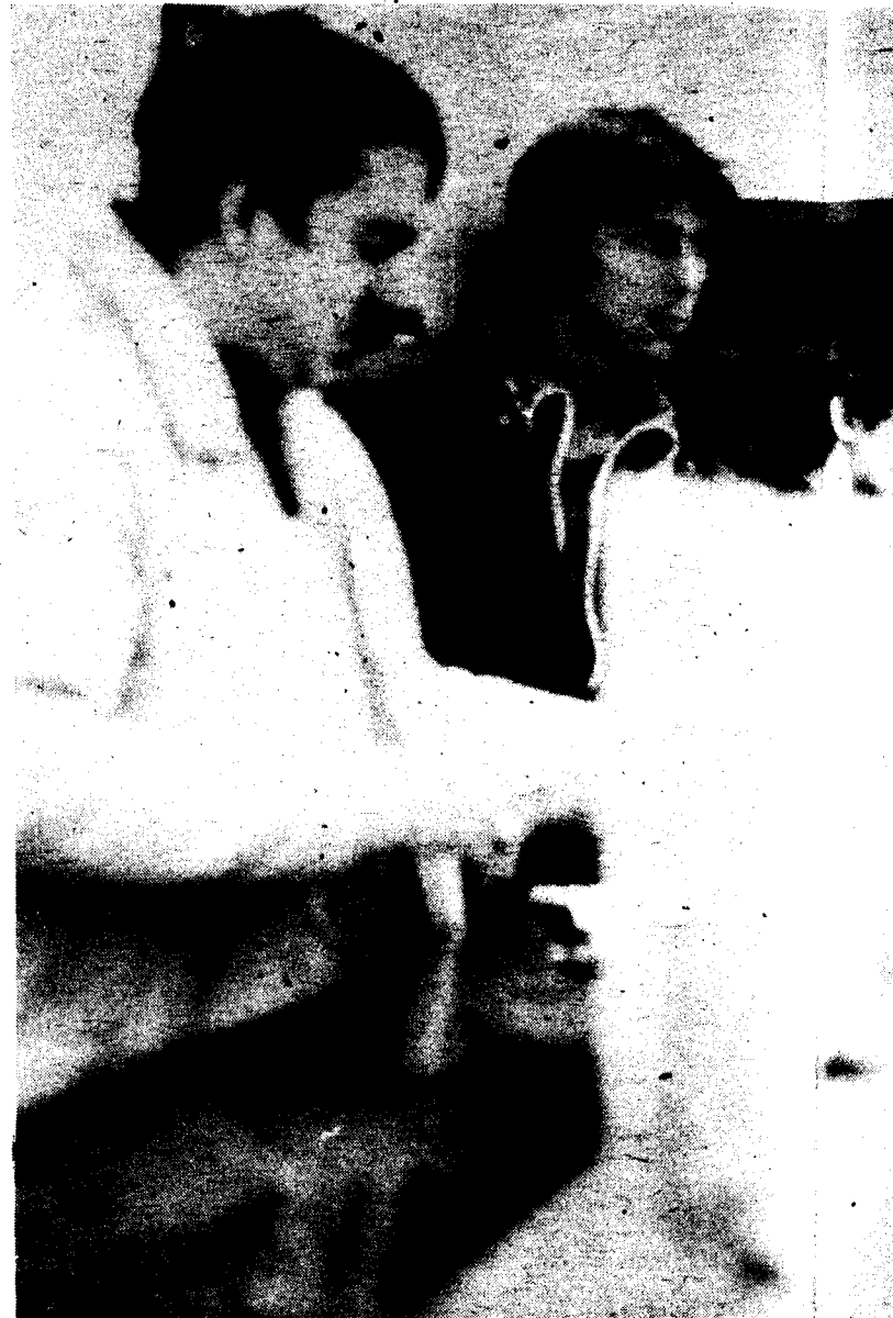
I'm sorry, but the University Park