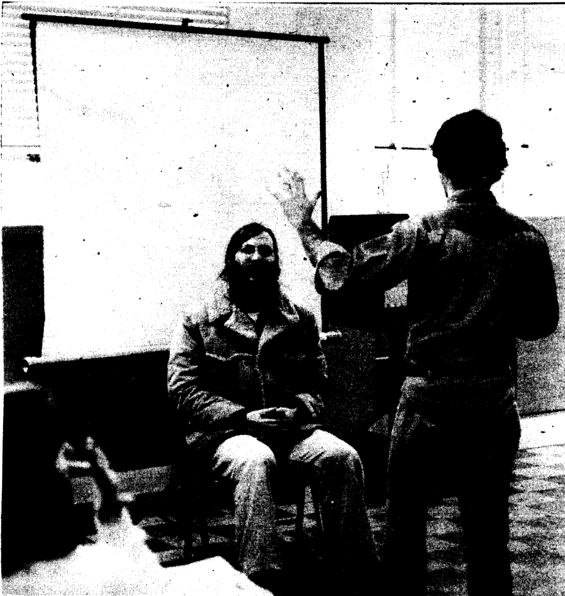
I bless you in the name of the father, the son, and the holy Gross...