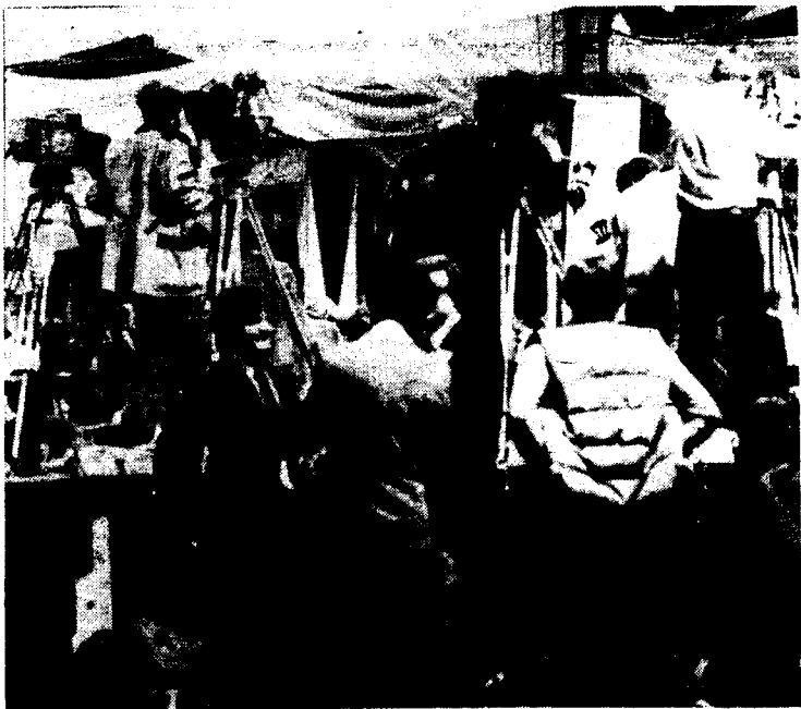
Local TV cameramen prepare to type the Vice President's comments.