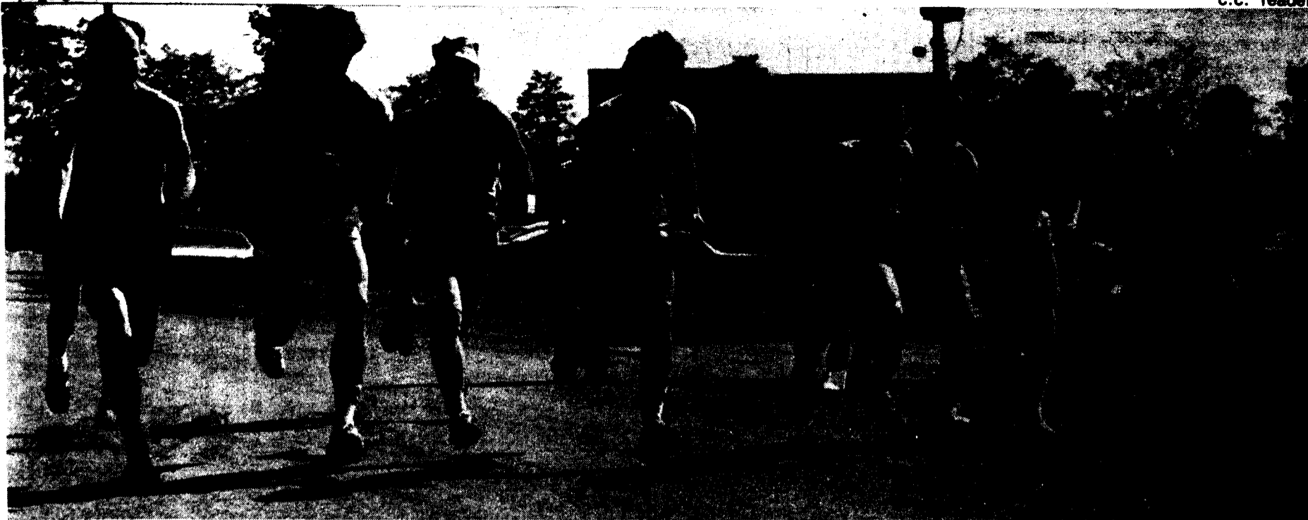
Runners in the dorm olympics shoot out from the starting line.

The second annual Dorm Olympics came to a close on Sunday, May 20, under blue skies and bright sunshine.