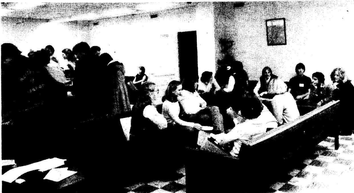
I'll trade you all the tea in China for half a kilo of pure Peruvian Flake: High school students came to Capitol Campus last week to participate in a Model U.N. sponsored by the IAA.