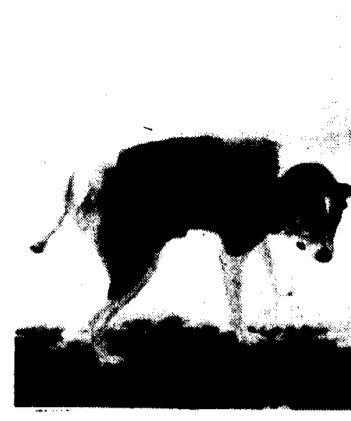
Rover Term 8 Cananities; Ruf Ruf We've just got to have more fire hydrants around campus!