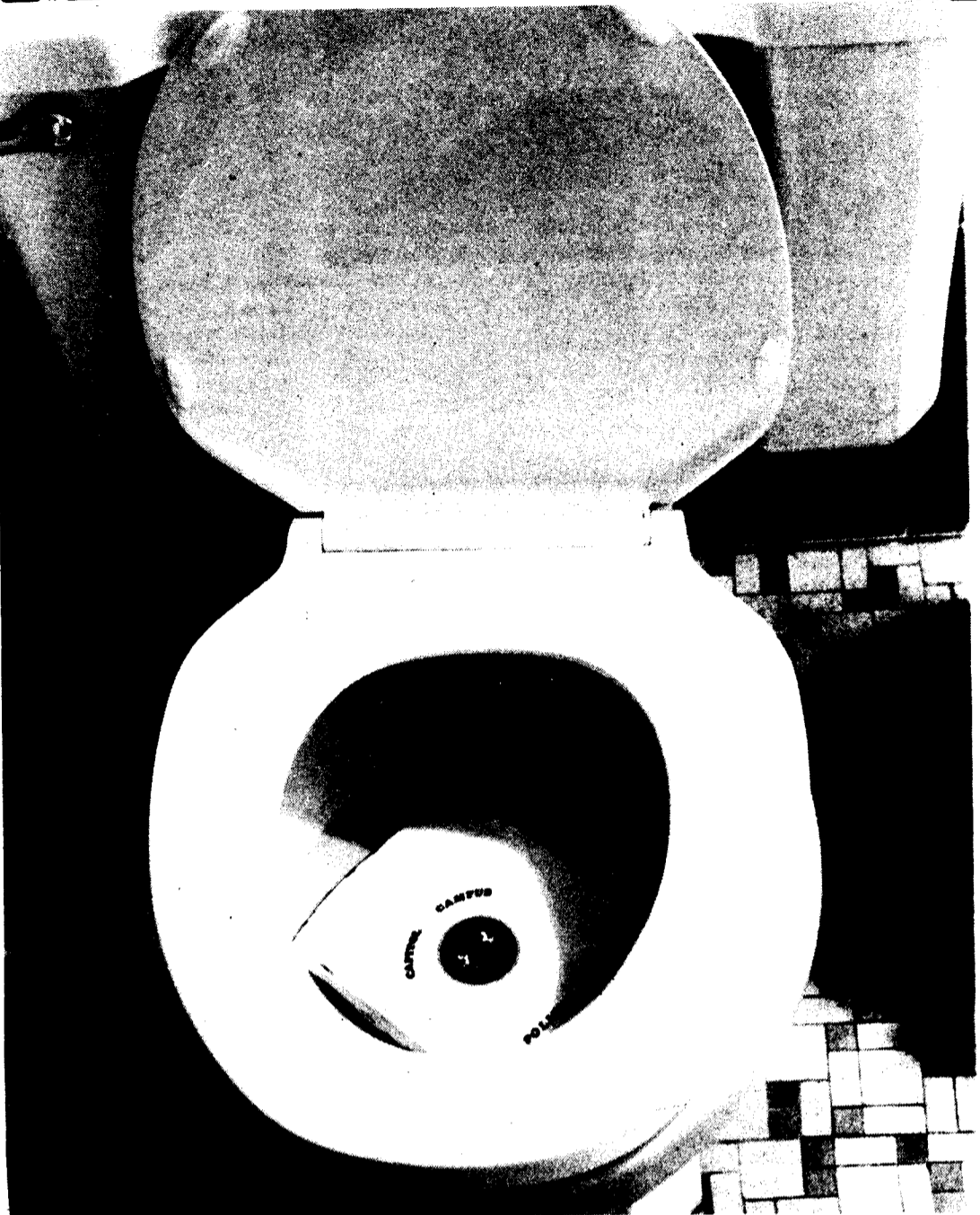
just don't flush - there might still be a chance.

On nights of major events the Multi-purpose room is opened and the hours are extended until the event ends. During this time the game room is not opened unless by special request.