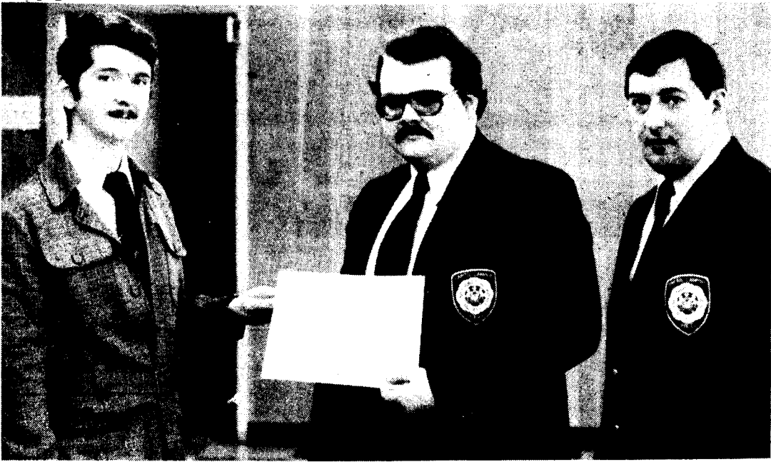
see story on page four