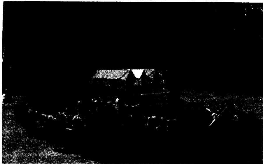
Student leaders separated into groups to discuss problems and solutions at Stone Valley.