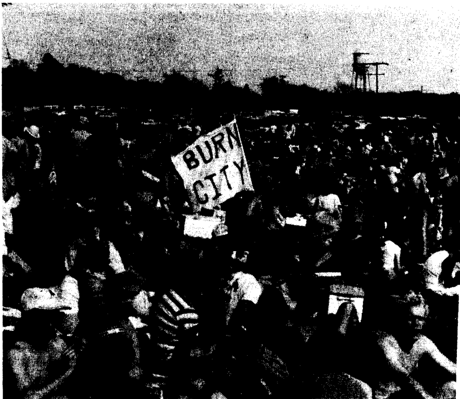
The day went well with few incidents giving students a chance to let loose before finishing spring term.