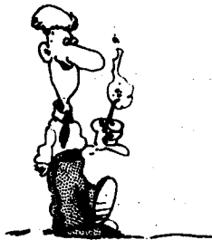
PHOTO CLUB MEETING THURSDAY APRIL 13 Time: 8:30 p.m. Place: Admissions & Placement Building Subject: Photographic Lighting

April 15 - Gordon Lightfoot in concert - York College of Pa., 7 & 10 p.m.