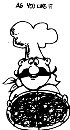
MADE FROM SCRATCH

Mid-Town Plaza (near bowling alley) Phone: 944-0741 closed Monday Tue. thru Thur. 11 a.m. - 12 midnight Fri. - Sat. 11 a.m. - 1 a.m. Sun. 1 p.m. - 9 p.m.