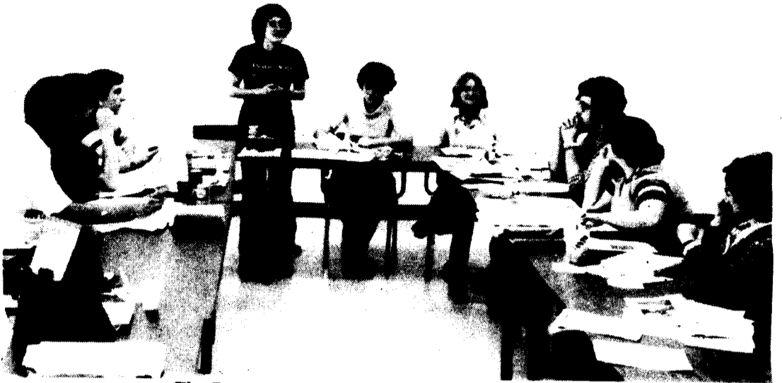
The Press Association of Commonwealth Campuses.