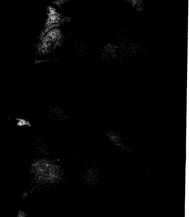
ho's decided it's about time on to business.