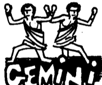
(May 21-June 21)