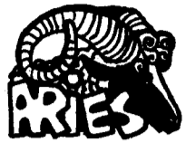
(March 21-April 19)