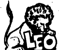
(July 23-August 22)