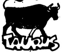
(April 20-May 20)