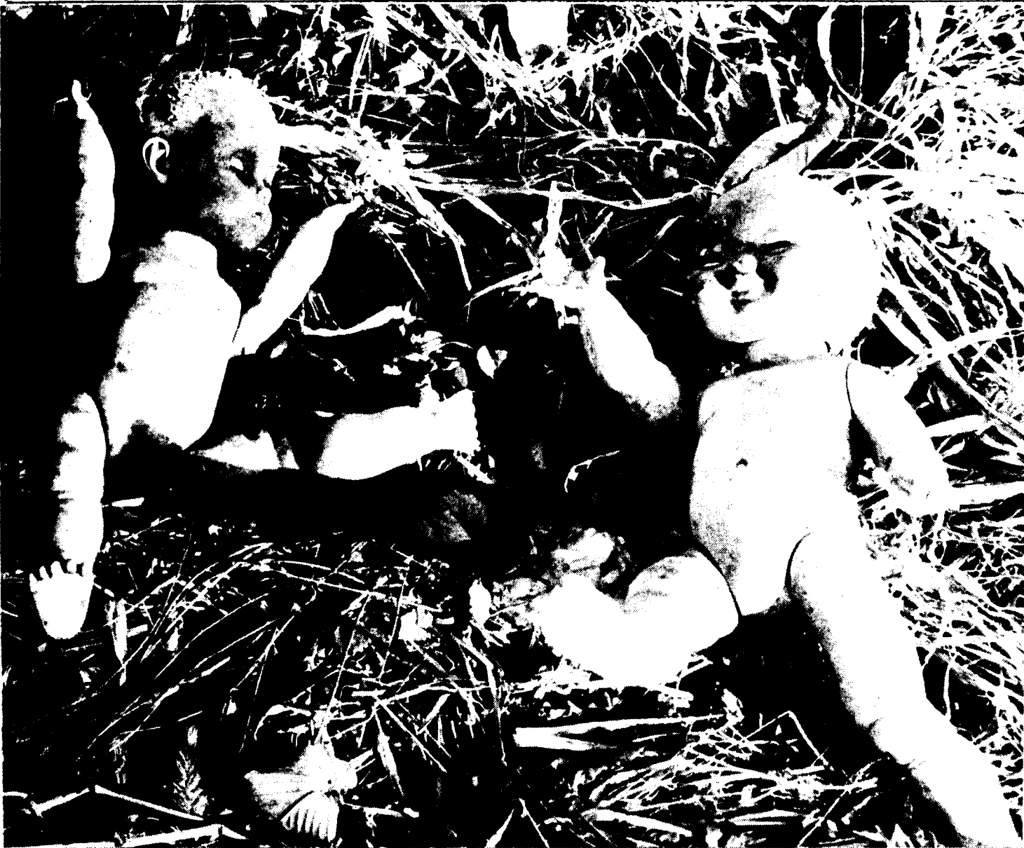
These were once perfectly normal babies, until the 727 crashed into the three-mile island.