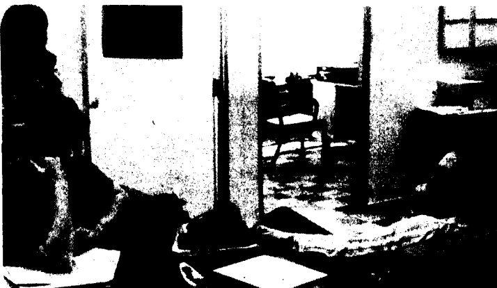
What do you want now, Fred!?