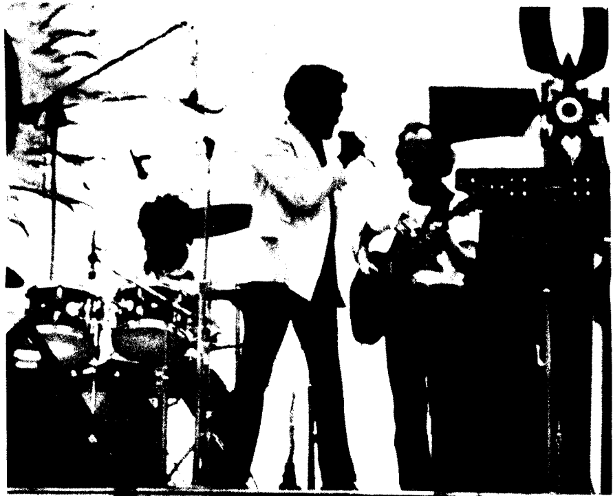
Elmer's Kids is temporarily taken over by a walk-on performer.