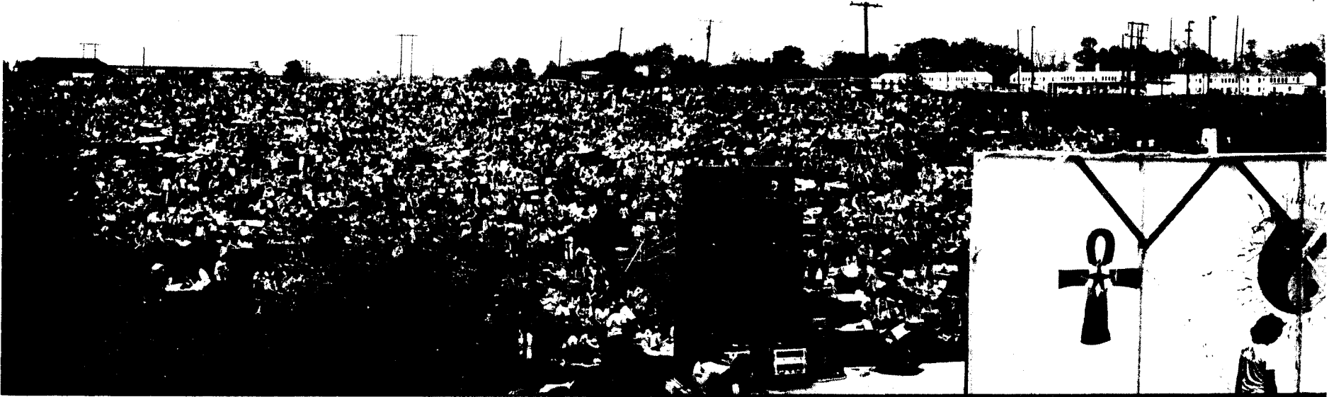
A panoramic view of the 12 - 15,000 merry-makers at this year's Music Festival.