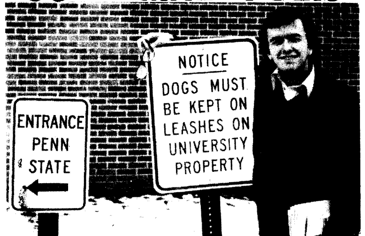
A friendly note: you can get busted for not having your dog on a leash. Read further details below.

The presence of animals on University property has had, in many cases, an adverse effect on the normal functions of the University by causing bodily harm to individuals, unsanitary conditions in University buildings and facilities, and nuisances.