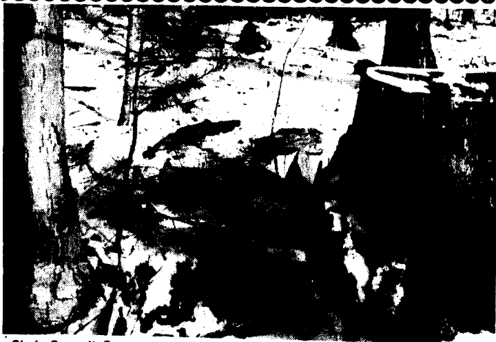
Clarks Summit, Pa.