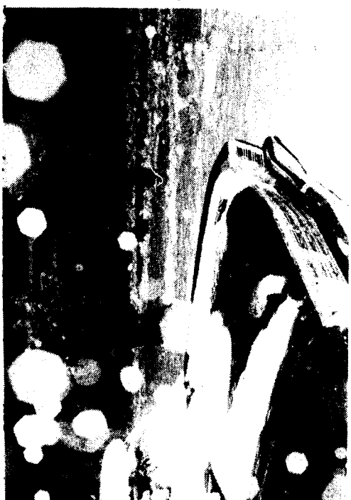
The electronic flash catches snowballers in action, causing reflections inside the lens of the photographer's camera.