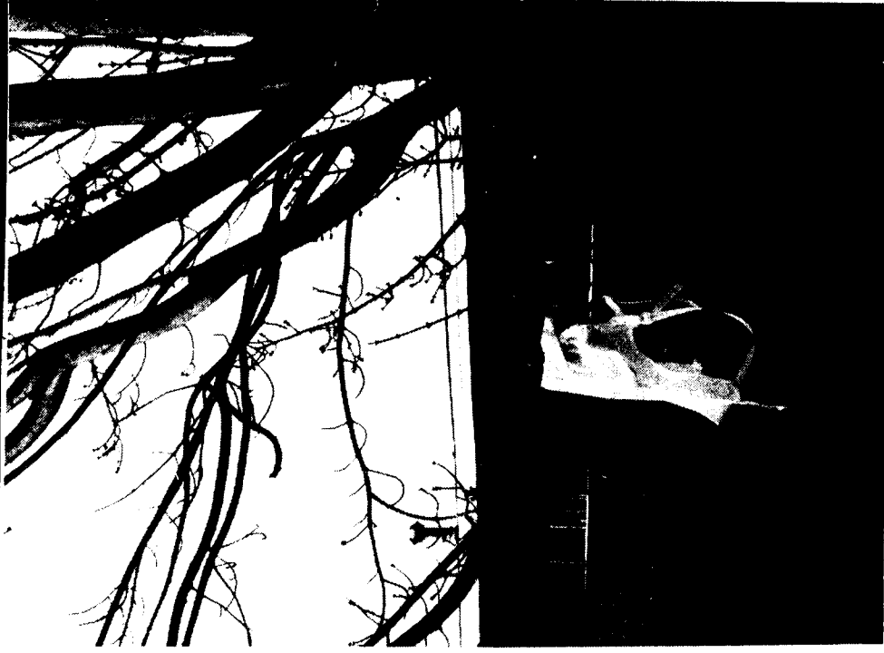
NEW YEAR'S DAY, 1975: A SCENE IN MEADE HEIGHTS.