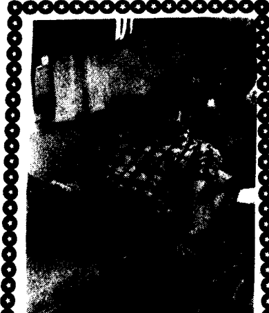
XGI Blood Drive netted the most precious gift of all - life giving blood.