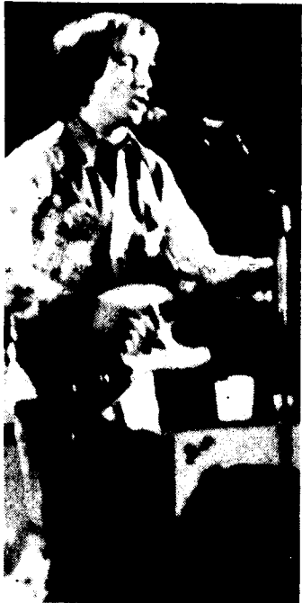
Ken Loggins of Loggins & Messina plays to a packed house at University Park on All-U Day, Nov. 2. All-U Day saw extraordinary involvement by all Penn State students.

Dec. 26-27-28 ( ) Jan. 2-3-4 ( ) Yes I am interested in the trip Please contact me ( ) Name _____ Phone _____