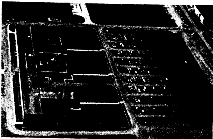
Main Building - It looks just as dead from the air.