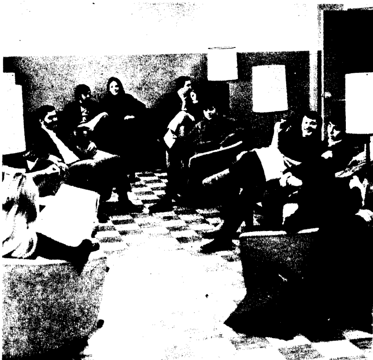
NEW STUDENT LOUNGE—Attracted many students to see the comfortable new furniture. The Lounge, located in W-107 next to Student Affairs, will be the location of Thursday's Open Pot Happening. Be there between 9:00 and 11:00 a.m. for the "LOUNGE WARMING!"