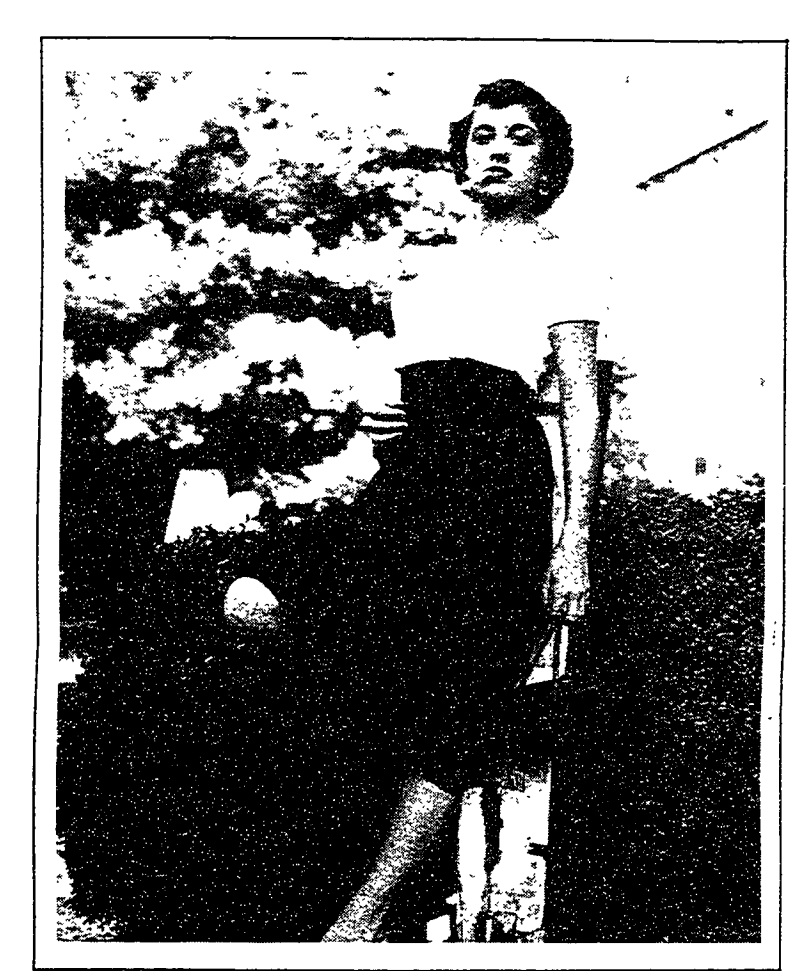
We've come along way, baby!?