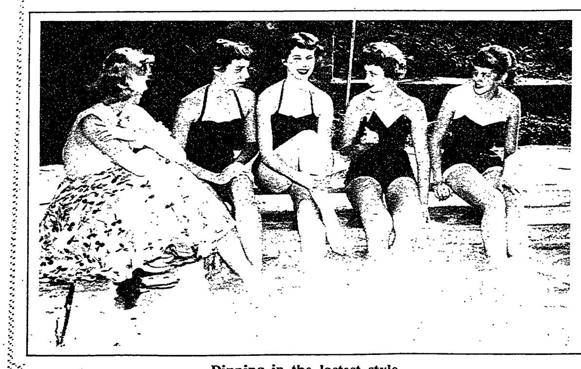
Dipping in the lastest style.