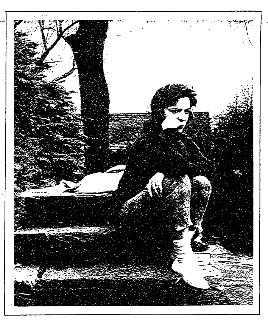
Lost in thought at Behrend.