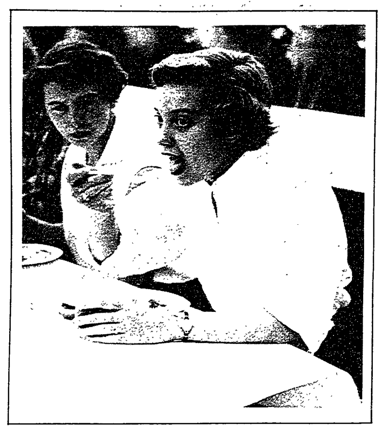
Freshman gets first taste of food.