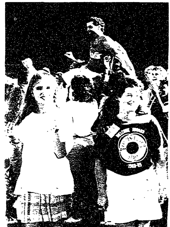
Another happy ending!