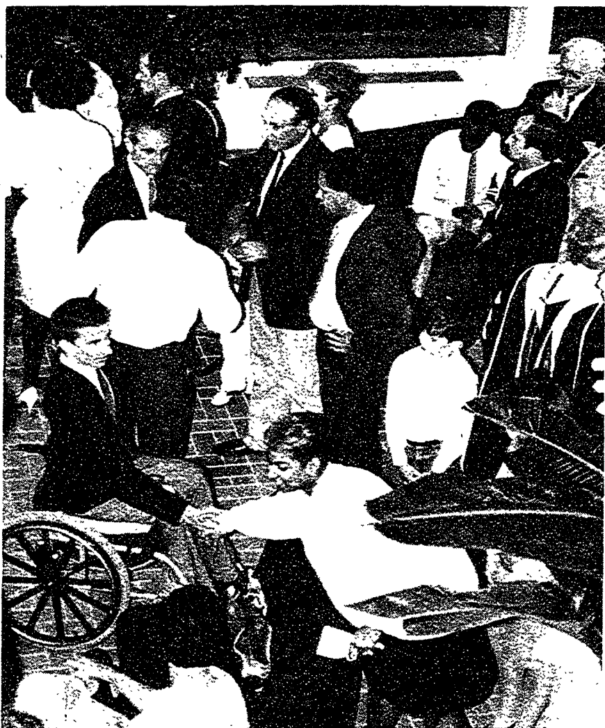
Hi, nice to meet you.