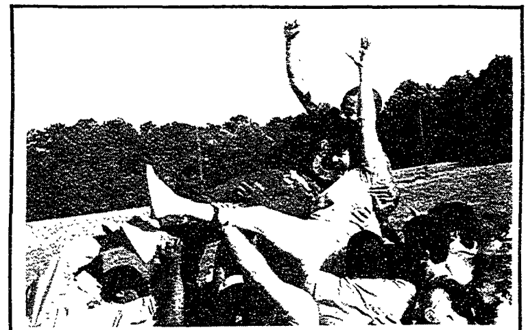
And the winners are...