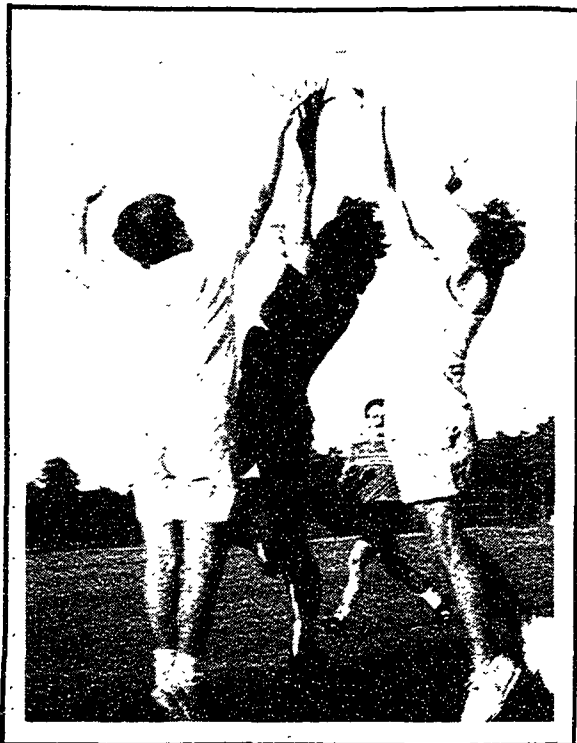
I got it! I got it! I got it!