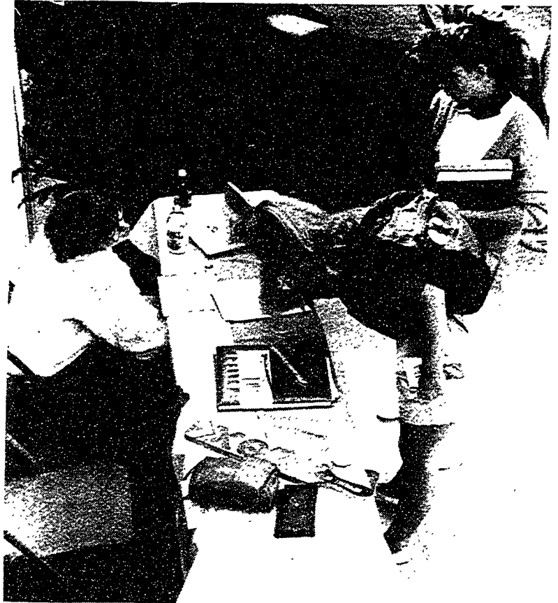
You want me to do what???