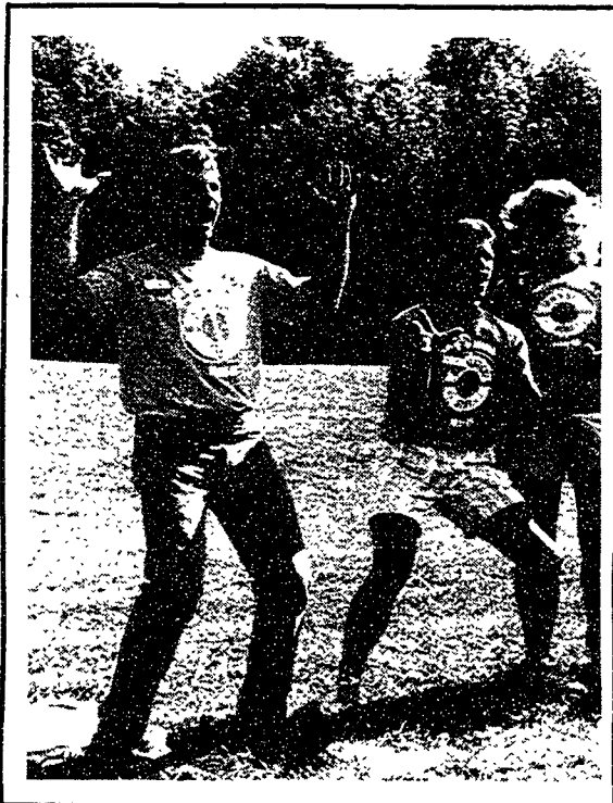
A Nittany Lion at heart.