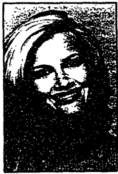
Diane Sawyer...Class of 1963

"It's wonderful... I only wish it happened while I was a student there. My days as a Behrend cheerleader are my most happy memories. I commend the administration for its brave stand... This is a glorious day in the history of Behrend College- Ooops- I mean Behrend University!"