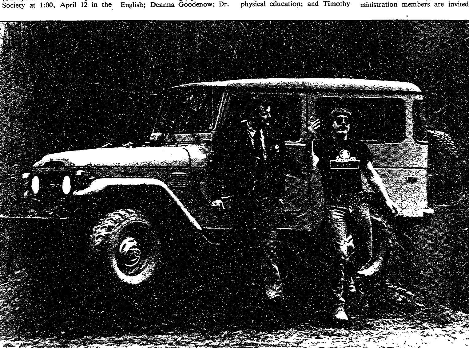
'Honest, ossifer, I got lost. . .'

Washington and Lee University, ODK strives to combine scholarship and leadership in five areas: athletics, government, service or religious organizations, the arts.