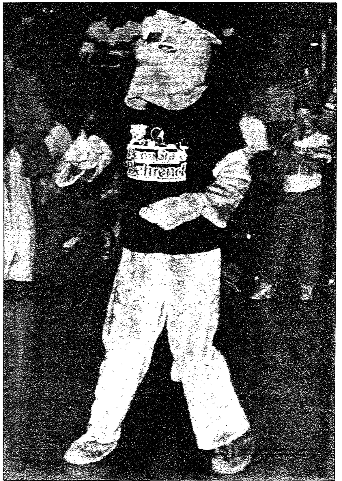
Behrend Cub mascot dances onto the court.