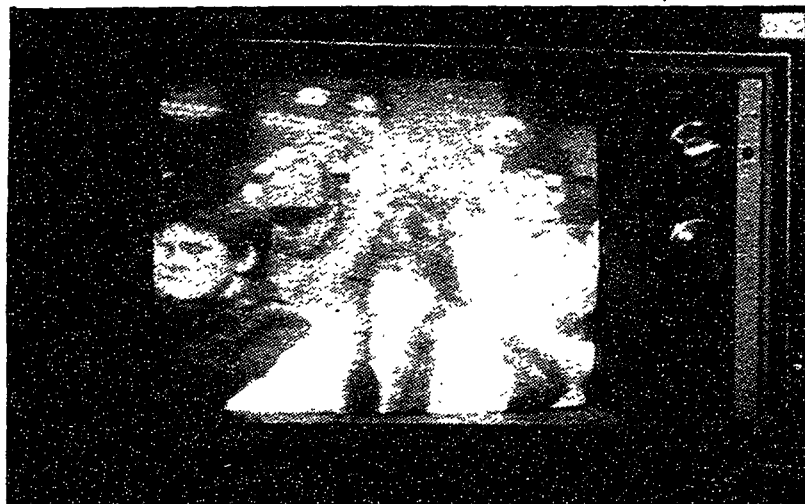
Agriculture 100 class in University Park, as seen by Behrend students transmitted by the T-1 Carrier.

Other spin-offs of the T-1 technology include guest lecturers from University Park 'in' Behrend classrooms, the viewing of sporting events and administrative conferences.