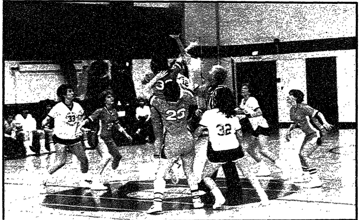
Jumpball marks opening of Cub's contest against Westminster on February 10.

Friday, Behrend plays host to the Lady Warriors of Daemen College at 6 p.m. and on Tuesday the Ladies entertain Mercyhurst, also at 6 p.m. Earlier this season Behrend defeated Daemen 69-24, but lost a 66-72 heartbreaker to rival Mercyhurst.