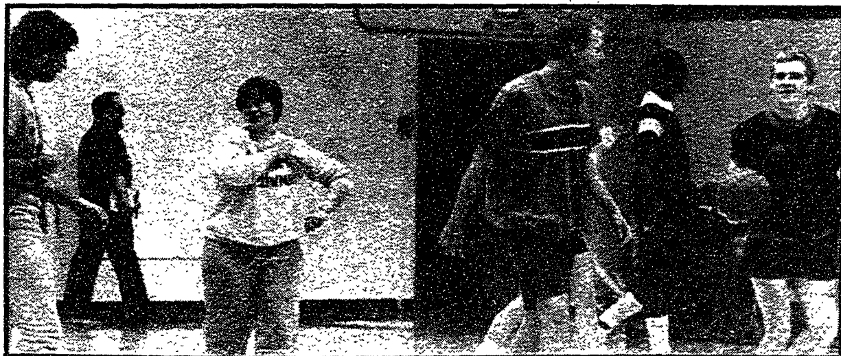
Students and faculty had the chance to compete in an exhibition basketball game Wed. Jan. 29 before the Behrend Alliance game. The students prevailed 62-30 (official), however, scoreboard read 61-47.

ponents by a margin of five rebounds per game. However, they are giving up an average of 62 ppg while scoring 57 ppg. Since the last issue, the Cubs have defeated Pitt-Bradford, 63-57, while losing to Point Park, 69-77, and Mercyhurst, 66-72.