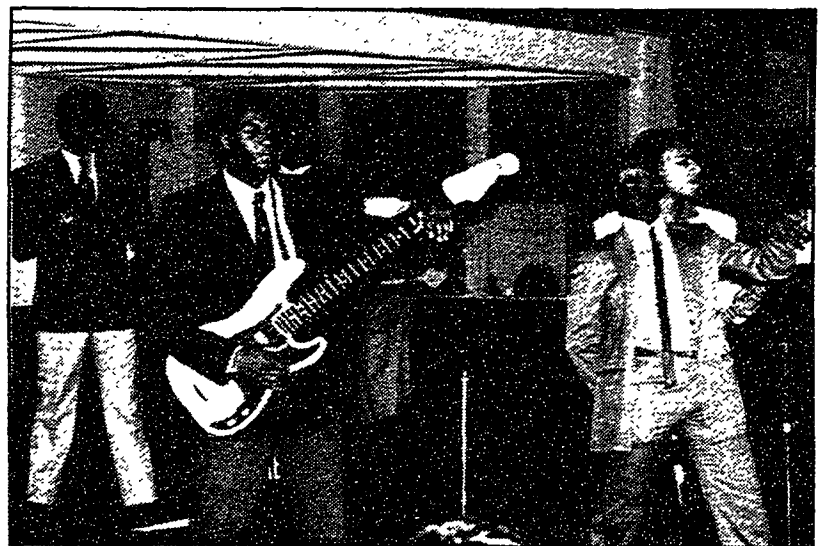
"The Time" won competition with their smooth moves