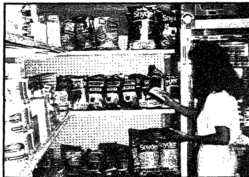
Convenience store provides resident students with a close-by mini-grocery store.

An additional bonus of coupon booklets from Food and Housing are redeemable at the store. Store coupons will also appear in each issue of the Penn State-Behrend Collegian , others will be sent through the mail. Students are welcome to request items they would like to have sold. The store hours are: Monday through Thursday 9 a.m. to 11 p.m., and Sunday 6 p.m. to 11 p.m.