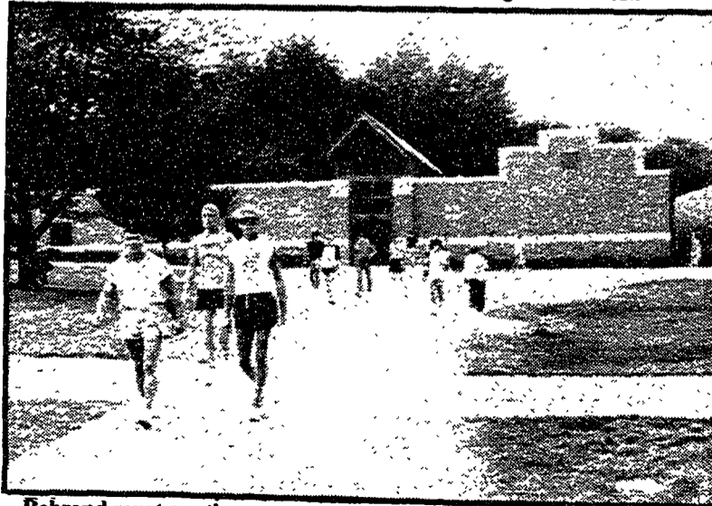
Behrend must continue expansion to keep up with consistent enrollment increases.

We've come a long way, but we've also got a long way to go." It looks as though Behrend is moving in the right direction.