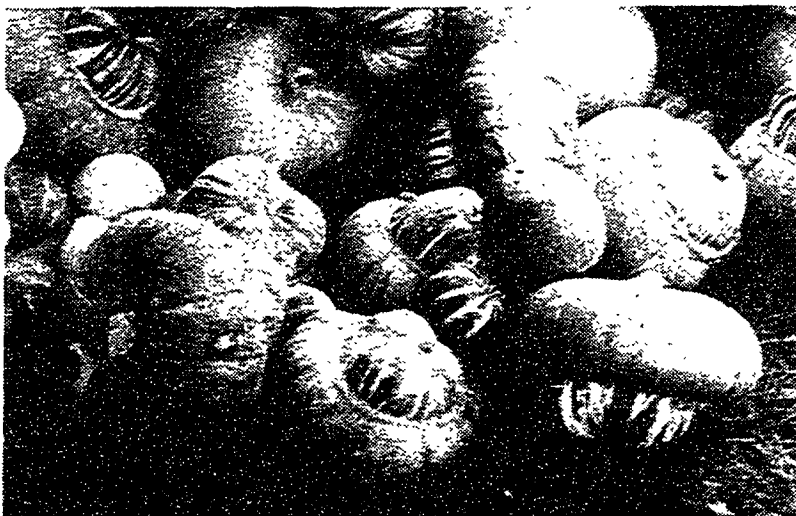
Pick a gourd... any gourd...

12:15, in Reed Seminar Room. ALL STUDENTS AND FACULTY WELCOME.