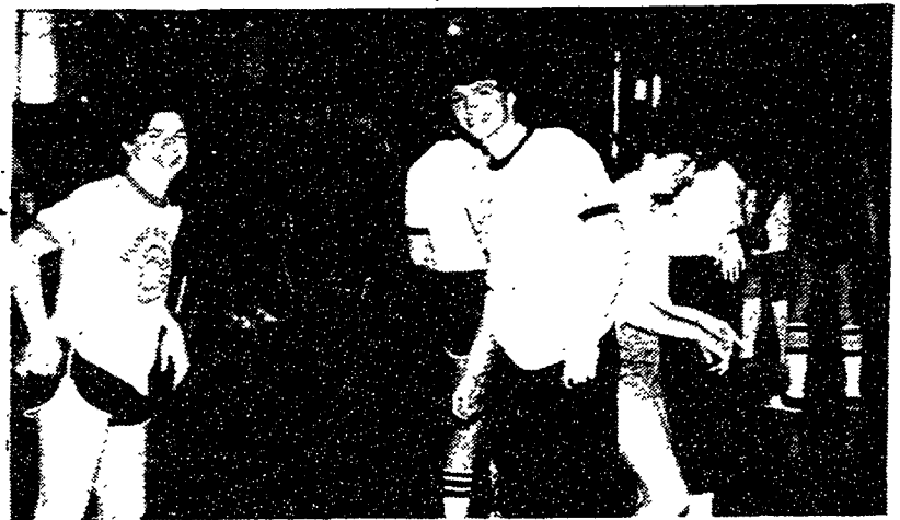
Marathons from years past

OBK is an honor society whose members are recognized for their scholarship, leadership and service to the Behrend and surrounding community, and is open to juniors, seniors, faculty, staff and alumni. The society hopes to make the dance marathon an annual event.