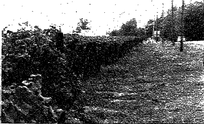
Local scenery, North East, Pennsylvania