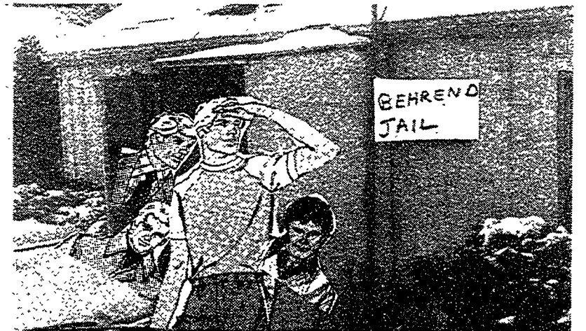
Behrend students are caught by hidden camera trying to escape from jail.

Also, many of the self proclaimed journalists currently on the Collegian staff are wanted by the police for some reason or another. Thus, they deemed it beneficial to not be photographed.