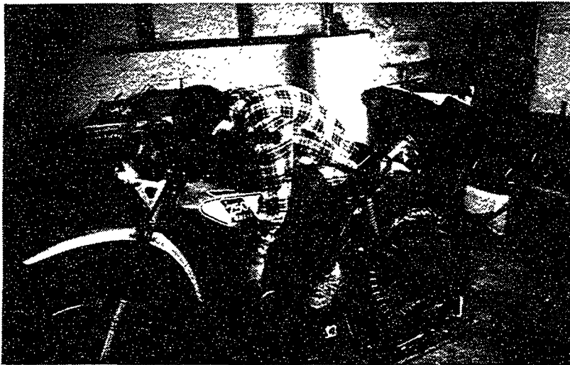
Motorcycle Defect Victim

On that note, the Collegian writer decided it was time to end his work on the Bullsheet and to go back to the office and collect his thoughts.