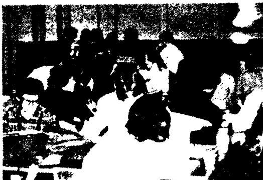
The commuter cafeteria is located on the second floor RUB.

all residence hall students and students with meal tickets according to the following schedule: Monday through Friday 7:00 - 8:15 a.m. - Breakfast 8:20 - 9:30 a.m. - Club Breakfast 11:05 - 12:45 p.m. - Lunch 4:30 - 6:30 p.m. - Dinner Saturday 8:00 - 9:45 a.m. - Club Breakfast 11:05 a.m. - 1:00 p.m. - Lunch 4:30 - 6:00 p.m. - Dinner Sunday 8:15 - 10:00 a.m. - Club Breakfast 11:30 a.m. - 1:00 p.m. - Brunch 4:30 - 6:00 p.m. - Dinner Students may buy a meal ticket for any meal at the door and may purchase meal tickets for the term in the Office of Housing and Food Services in Dobbins Hall.