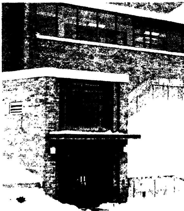
Dobbins Hall provides meal service to resident students and students with meal tickets.