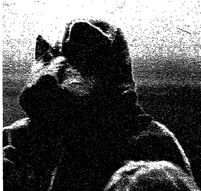
The Behrend Cub looks on as the hoopers win in overtime.