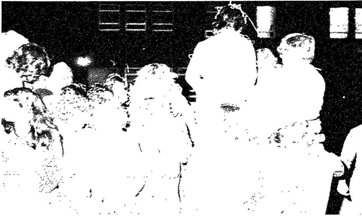
A hay ride that'll never be forgotten