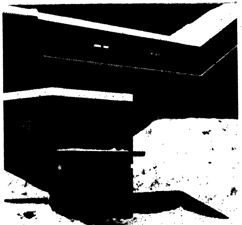
Dobbins Hall provides meal services to resident students and students with meal tickets.