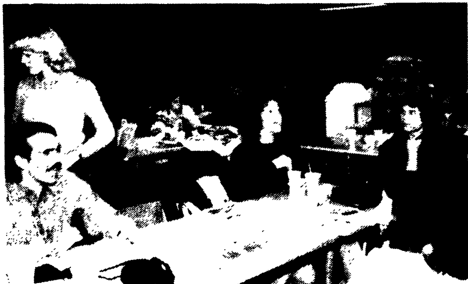
The commuter cafeteria is located on the second floor RUB.

Students may buy a meal ticket for any meal at the door and may purchase meal tickets for the term in the Office of Housing and Food Service in Dobbins Hall.