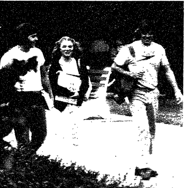
It's off to classes we go.

The Collegian Needs You! Join The Staff Today