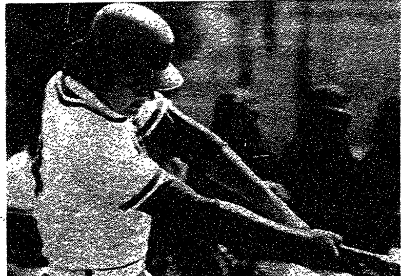
Another smash for the Cubs "nine" helps propel the team to an even split in four games and an 11-5 overall season thus far.