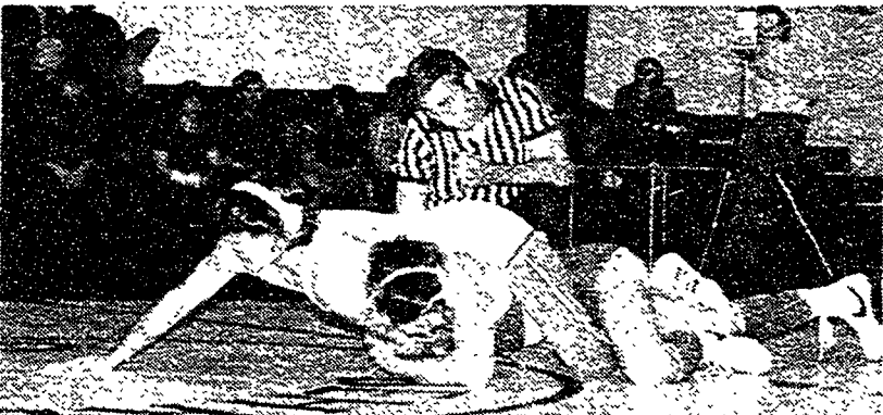
A Behrend wrestler displays his overpowering strength as he dominates his opponent and chalks up a few points.