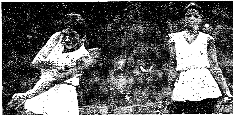
The girls tennis team is diligently working, trying to secure impressive strokes against the opponents.